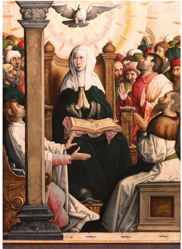
Juan de Flandes, Pentecost , Flemish, 1514-1519 Madrid, Museo Nacional del Prado