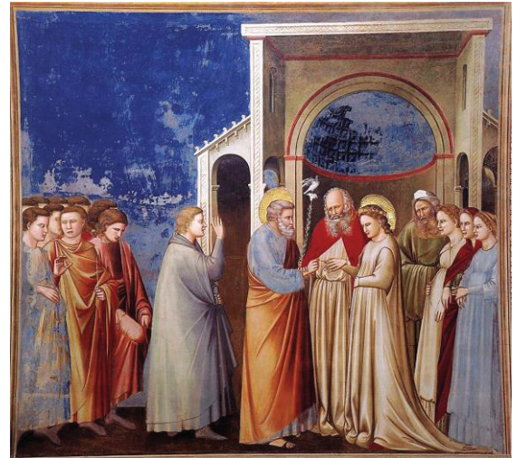
Giotto, The Marriage of Mary and Joseph Italian, 1304-1306 Padua, Scrovegni Chapel

Scenes, other than Nativity, Presentation or Finding Jesus in the temple, taken from apocryphal stories of the life of Mary, began to appear, among them the story choice of Joseph as Mary's husband and the marriage ceremony itself. According to the stories, Mary had many eligible suitors. In order to ensure that the choice would fall to a truly good man, the Temple elders required all the suitors to bring a dry rod to the Temple. The rods were placed on the altar overnight. In the morning, only one had blossomed, the rod belonging to Joseph.